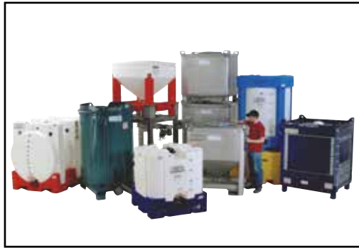
Transportation containers hold from 60 to 550 gallons.