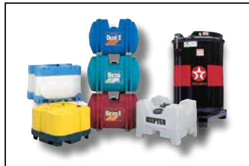
Customized mini-bulk containers

For larger stationary applications, Snyder offers the industry's broadest range of tanks – from 8 to 16,500 gallons – in shapes that meet your specific needs. To match your special function requirements, we also market a complete line of accessories, such as stands, seismic tie-downs, ladders, fittings, gaskets, sight gauges, heat tracing and insulation.