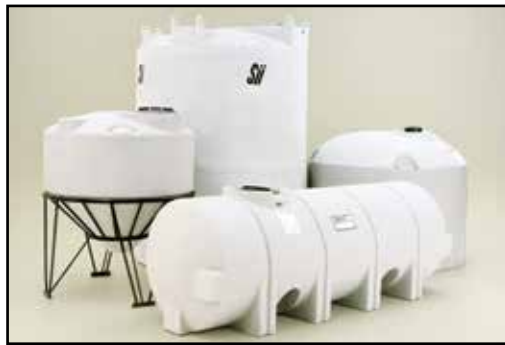
Stationary tanks store from 8 to 16,500 gallons.

Snyder intermediate bulk containers (IBCs) are durable, corrosion-resistant and economical. These long-term, reusable containers are ideal for the transportation of both hazardous and non-hazardous liquid materials.